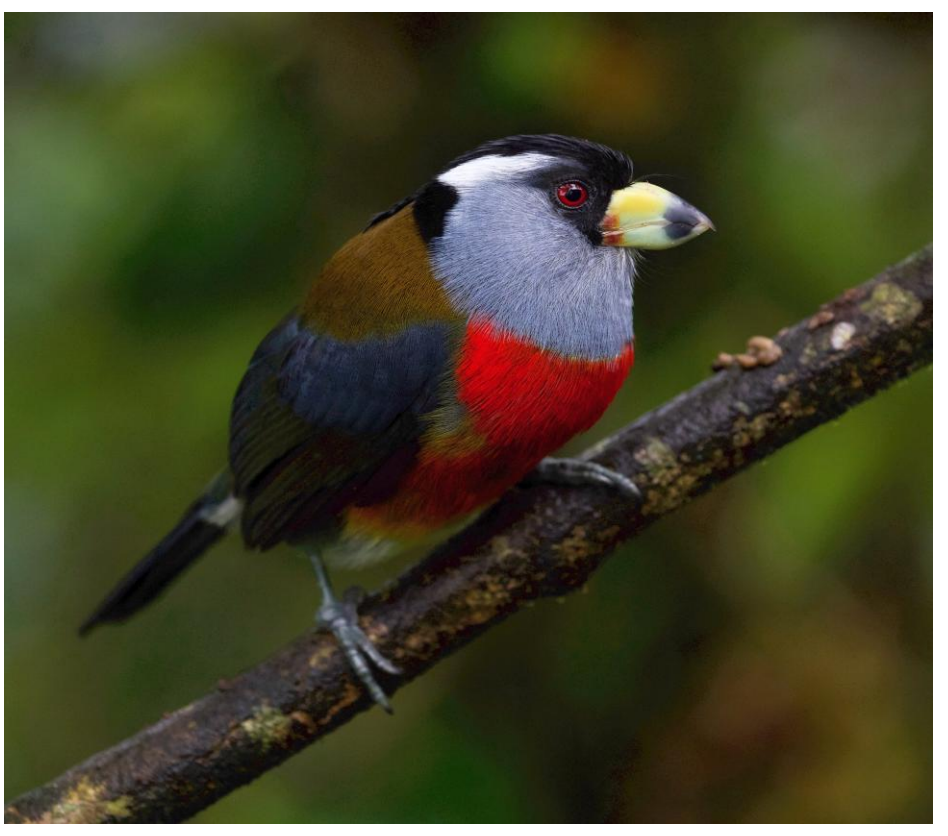
Toucan Barbet

After a relatively moderate drive we will get to a small property, run by a family that has set out bird tables and hummingbird feeders, and surely will make us salivate upon viewing such wonderful birds. Among the hummingbirds, we may see White-necked Jacobin, Rufous-gaped Hillstar and the impressive Empress Brilliant. There might also be a pair of Toucan Barbet as well as less impressive birds such as Lemon-browed Flycatcher and Golden-faced Tyrannulet. The bird table will probably be hosting Golden, White-lined and Silverthroated tanagers and the conspicuous Bananaguit will observed wandering