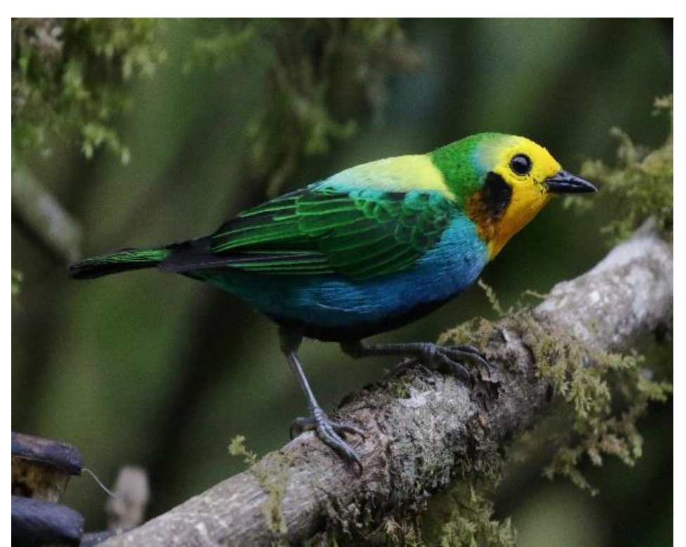
Multicolored Tanager (Chlorochrysa nitidissima)

<u>December 11, Day 6: La Florida and Bosque de Niebla</u>. After breakfast we will take a short drive to La Florida, a small property hosting forest bird species that are normally labeled as "impossible-to-see." This site has become famous for having a feeder where Chestnut Wood-Quail comes for few minutes right after