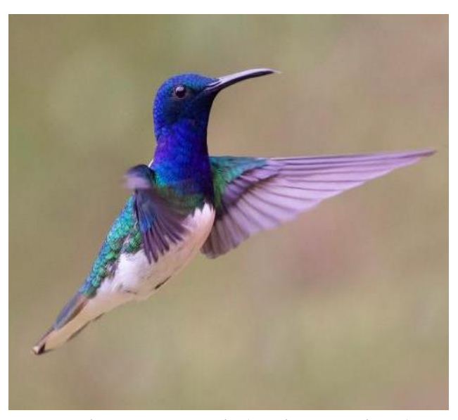
White-necked Jacobin (Florisuga mellivora)

provide the opportunity to see several species of hummingbirds and tanagers at bird feeders without having to spend full days of birding in the field.