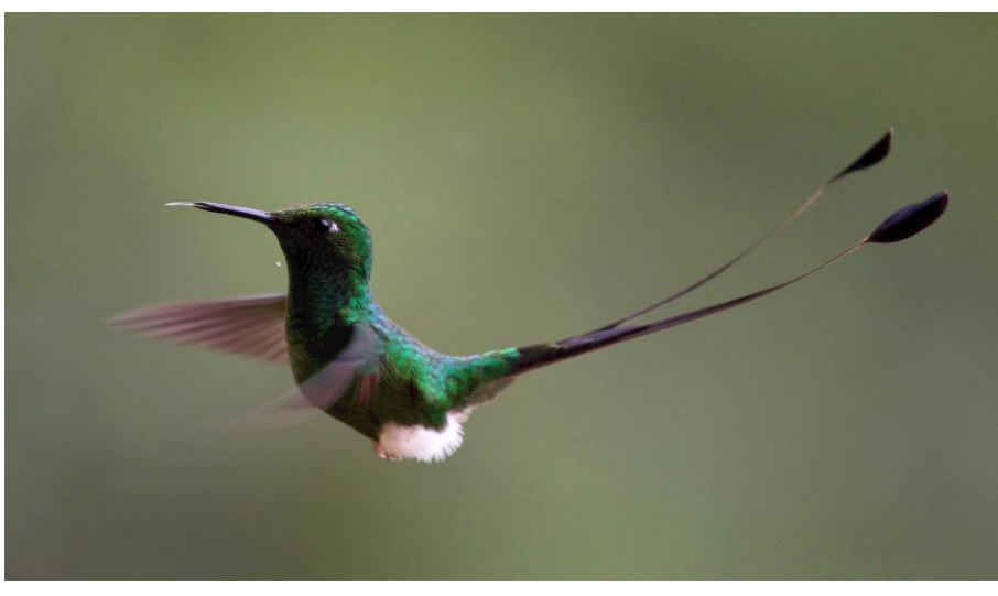
Booted Racquet-tail © David Ascanio

Continuing our drive up along the Western Andes, we will eventually reach Araucana Lodge, our home for the next four nights. In the lodge gardens there are hummingbird feeders and bird tables with fruits. Time allowing, we will explore the