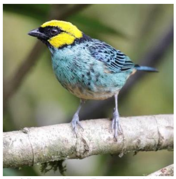
Saffron-crowned Tanager (Tangara xanthocephala)

fruiteaters may give their unique vocalization and Chestnut-breasted Wren will be heard giving its distinct penetrating call.