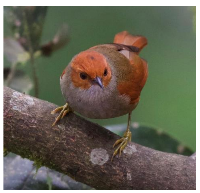
Red-faced Spinetail (Cranioleuca erythrops)

December 6, Day 1: Arrival in Cali. Upon arrival at Alfonso Bonilla Aragón International Cali Airport (airport