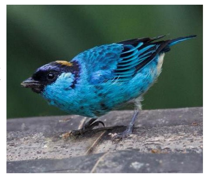
Golden-naped Tanager (Tangara ruficervix)

Lodge we plan to make daily drives to La Minga, La Florida, Doña Dora bird feeders and Bosque de Niebla in the famed El Kilometro 18 or "KM 18" area. Each location will offer new hummingbirds and tanagers as well as other birdlife. Collectively, we about species should get 20 hummingbirds and more than 20 species of tanagers. including Saffron-crowned, Golden, Bay-headed, Blue-capped, Goldenchested and Golden-naped tanagers. The drive to the Anchicaya road will expose us to other fascinating birds such as the Toucan Barbet, Torrent Duck, Violet-tailed Sylph and White-capped Dipper. During our tour, we plan to have breakfast at 6:00 am,