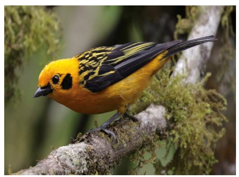
Golden Tanager (Tangara arthus)

December 8, Day 3: Reserva Natural Cañón del Río Bravo. Packed with tree ferns, epiphytes, orchids and mossedcovered trunks, the wonderful premontane humid forest (cloud forest) of Cañón del Río Bravo is a protected area that offers exceptional birding opportunities. Since all of our search will be along the road, to maximize our time, the morning birding will focus on the higher areas and the afternoon birding on the more distant forest. Although the birdlife is very rich, one cannot take anything for granted. We hope for an overcast day which keeps bird activity high. In previous years we have come across Booted Racket-Tail and Crowned Woodnymph, also Masked Trogon and