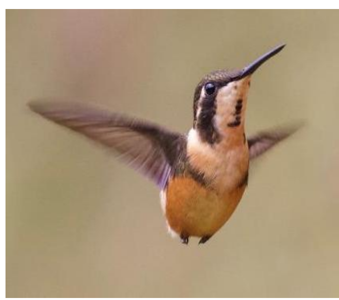
Purple-throated Woodstar (Calliphlox mitchellii)

December 9, Day 4: Drive to Araucana. An optional early morning will find us at the surroundings of La Huerta. We might see Lineated Woodpecker, Brown-capped Vireo, Squirrel Cuckoo and Bronze-winged Parrot. As we enjoy the birdlife getting active with the morning, we will surely be serenated with the penetrating song of the Tropical Mockingbird and maybe welcomed with the unique sound of a slow-moving primate, the Venezuelan Red Howler.