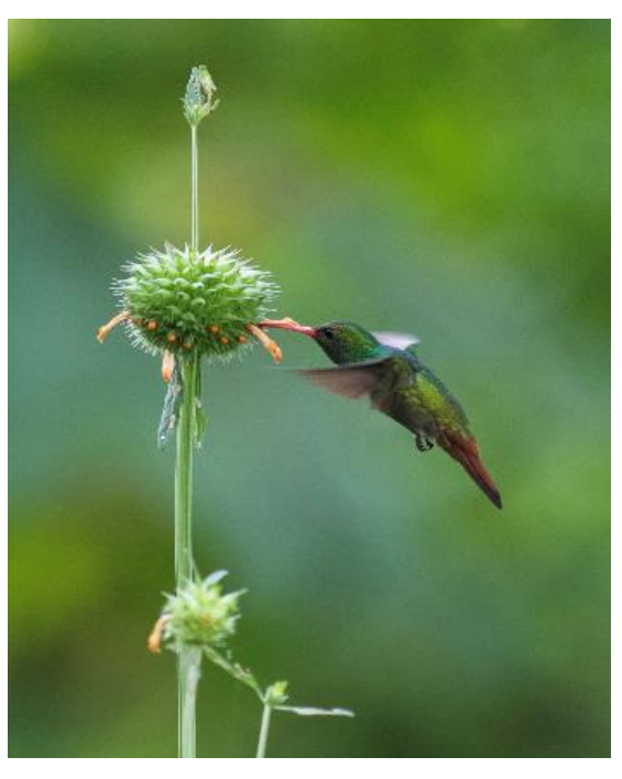
Rufous-tailed Hummingbird (Amazilia tzacatl)

<u>December 11, Day 6: La Florida and Bosque de Niebla</u>. After breakfast we will take a short drive to La Florida, a small property hosting forest bird species that are normally labeled as "impossible-to-see." This site has become famous for having a feeder where Chestnut Wood-Quail comes for few minutes right after